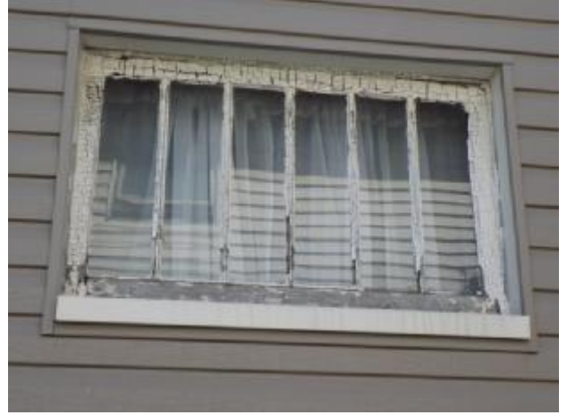
Chipped & peeling paint