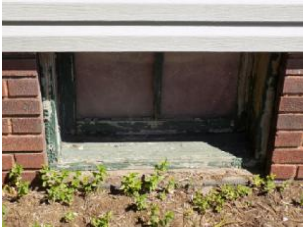
Chipped & peeling paint