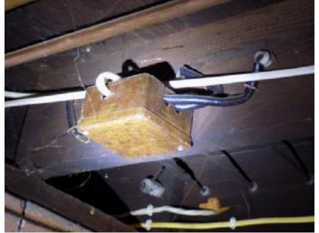
Knob and tube spliced to romex