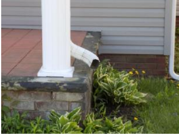
Down spouts need extended