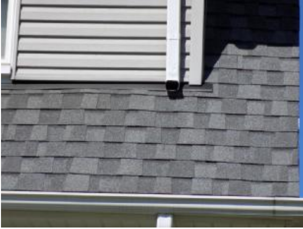
Missing gutter extension