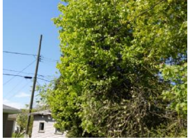
Tree limbs on service drop