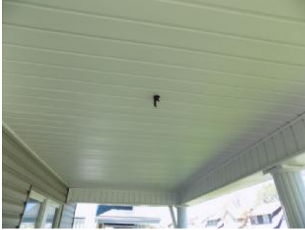
Bare wires on porch roof